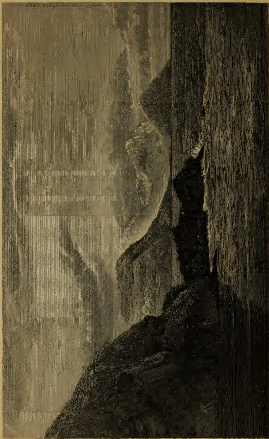
NORTH SIDE OF ENTRANCE TO NACHYAK INLET, LABRADOR. SHOWING THE STEEP AND UNGLACIATED CHARACTER OF THE MOUNTAINS.