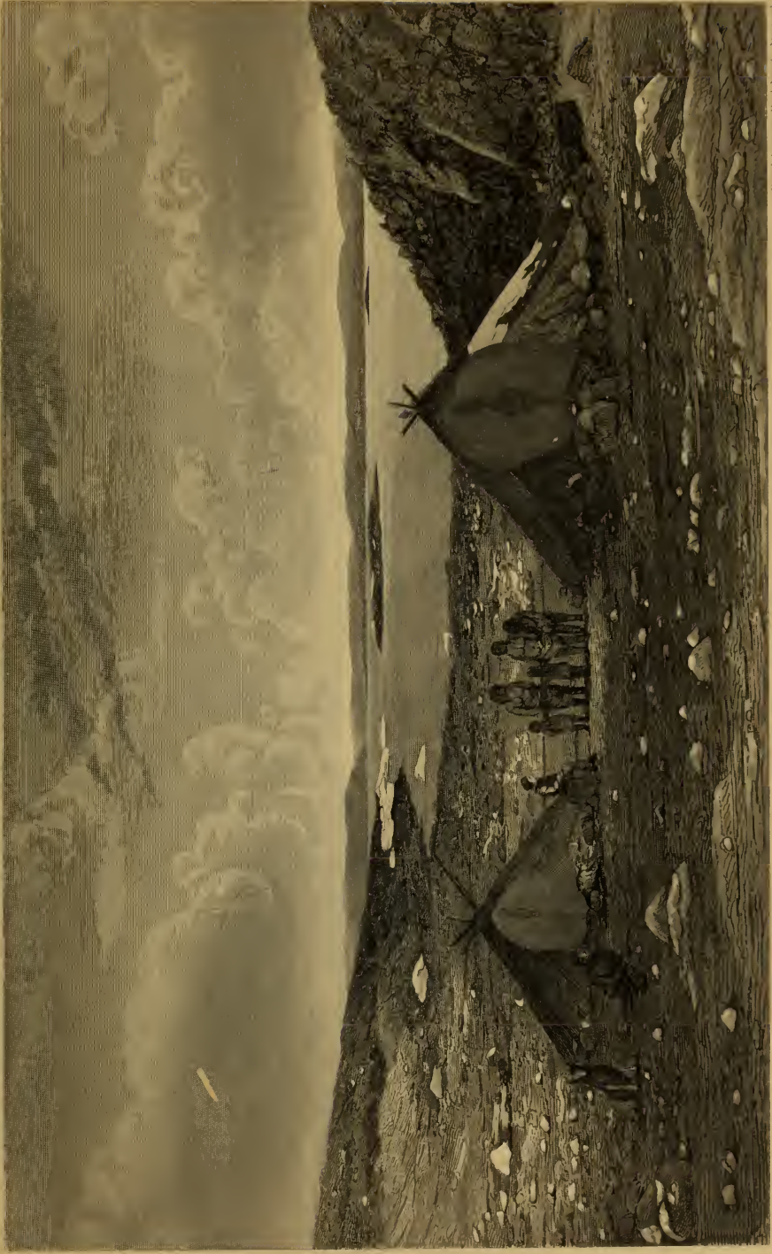
British American and Book Co. Montreal