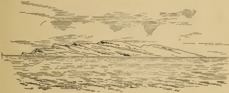
J. GORDON ISLAND FROM THE NORTH.

An opportunity was afforded me of landing upon a small island lying about two miles to the southwest of Gilmour Island (see chart) in latitude 59^{\circ} 48' , longitude 80^{\circ} 6' . It was found to consist entirely of a greenish-grey diorite, which, on fresh fracture, is mottled with darker and lighter shades. In a vertical section, found on the east side of the island, the diorite presents the "bouldery" or concretionary appearance shown in the annexed sketch, the larger divisions having a diameter of about two feet. The rock is cut by small veins of quartz, running in a northwesterly course (true) in which specks of copper pyrites were detected. It also contains thin, short and irregular veins of asbestos and green epidote. Old weathered surfaces of the diorite are very rough, but nearly the whole island bears the marks of glaciation. On the southern and central parts of the island the principal striae run N. 60^{\circ} to 80^{\circ} E., magnetically, or N. 20^{\circ} to 40^{\circ} E., astronomically, the