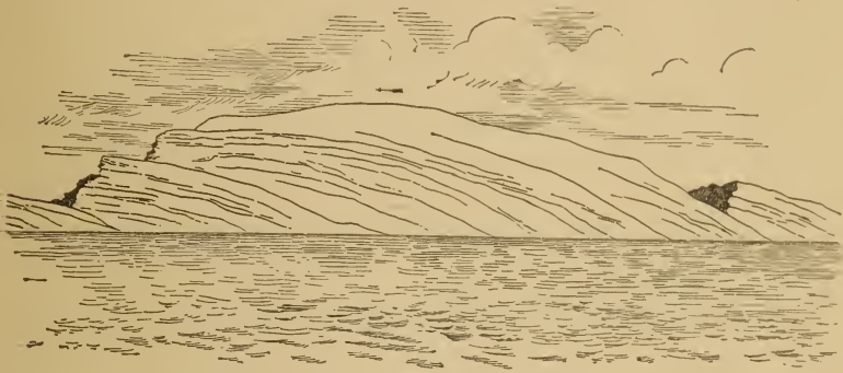
CAPE ON NORTH SIDE OF OUTER DIGGES ISLAND.

was found to be about eight miles long and three miles wide, and to be separated from the Inner Digges by a straight channel, about one mile wide. It is formed entirely of Laurentian gneiss, which strikes with the longer axis of the island. This island has been thoroughly glaciated. Around its western end the groovings run north-eastward (true), but along the north side they set more nearly east, showing that the stream of ice was flowing out of the bed of Hudson's Bay and eastward in the Strait. The outer points of this shore are all rounded and bald, with the glacial grooving and fluting strongly marked, as may be seen in the accompanying sketch of one of these small capes.