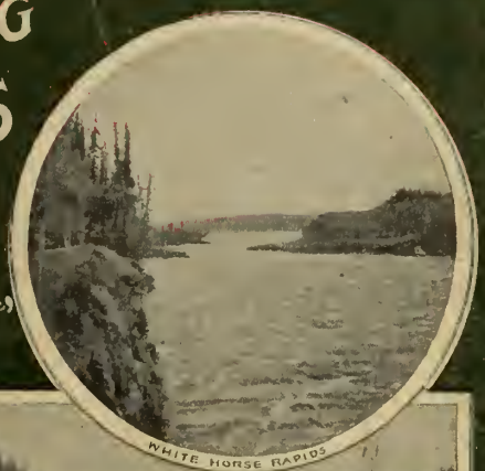
WHITE HORSE RAPIDS