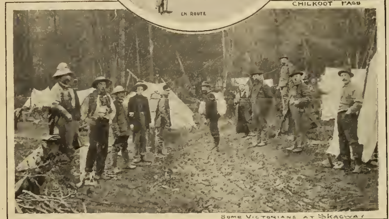
SOME VICTORIANS AT SKAGWAY